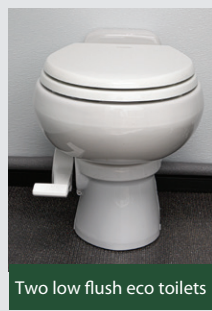
Two low flush eco toilets