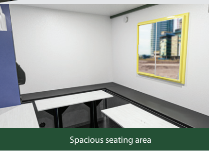
Spacious seating area