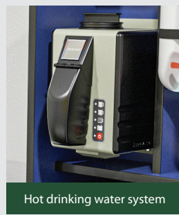
Hot drinking water system