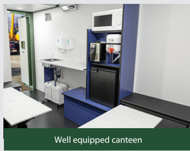
Well equipped canteen